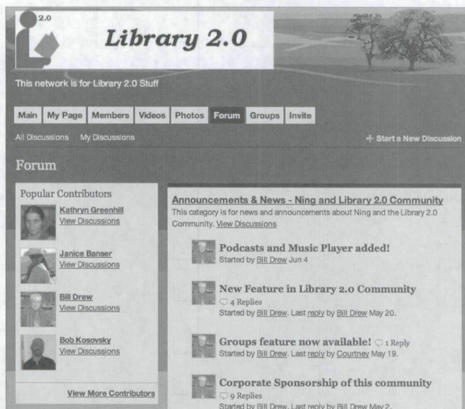
Figure 13 Discussion forums at the Library 2.0 Ning.

Interested readers might check out Ning or the L2 Ning, or create their own network. Other thriving library-related Nings include the American Library Association Ning and a Ning for Librarian Bloggers.